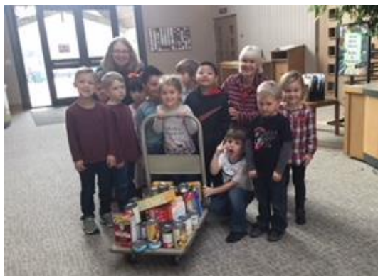
Preschool Children with food collected for the food bank.