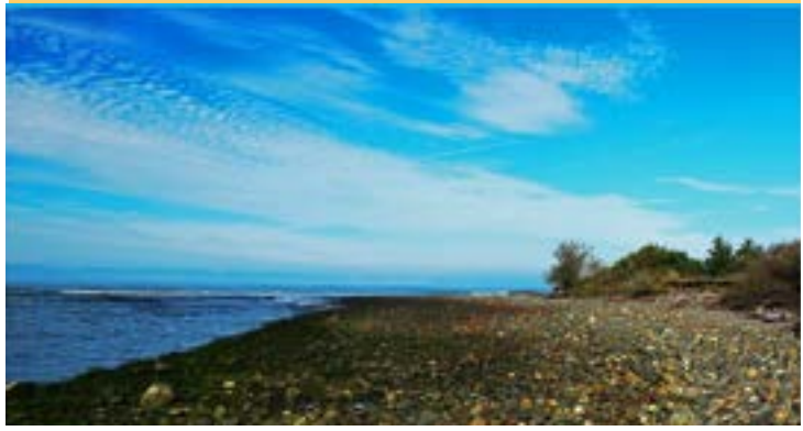
Lyre Conservation Area Tuesday, August 13 at 9am

2.5mi Round trip with a 235' elevation gain Meet on the southside of the parking lot. Bring a picnic. Great hike for kids and dogs!